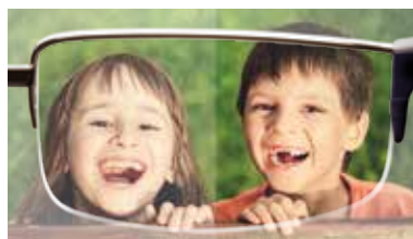
KODAK Clean'N'CleAR Lens