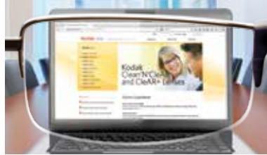
Regular Lens KODAK Clean'N'Clear Lens

KODAK Clean'N'Clear Lenses provide eyecare professionals with a recognizable customer brand known for trust, respect and loyalty to offer patients.